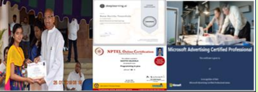
LEARNING MANAGEMENT SYSTEM